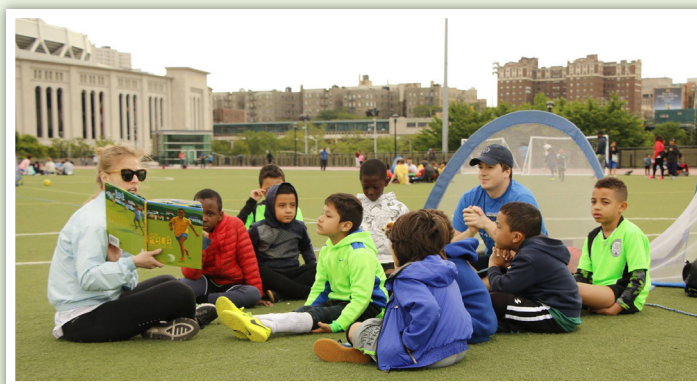
High school students and SBU leaders conduct reading circles

More than 600 young people and their families attended the event, at which high schoolers read to younger children and books were put into the hands of the students, after everyone let off steam on the soccer field.