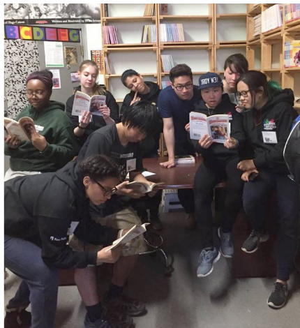
SUNY New Paltz students donate their services to help The Lisa Libraries.