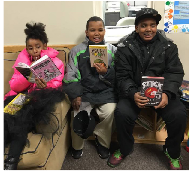
Pictured above, three happy clients at one of Trenton's Family Success Centers.

They operate two Family Success Centers, described as "one-stop neighborhood centers" where struggling families can access a range of services to meet basic needs. Starting in 2015, twice monthly Reading Groups have welcomed more than 20 children with their parents or grandparents for an interactive story time, which includes crafts and a snack in addition to stories. Now, with a donation of books from the Lisa Libraries, children attending the Reading Groups can choose books to take home and keep. And next year, the Children's Home Society will receive a second donation, this one for the bookworms attending the summer Reading Groups.