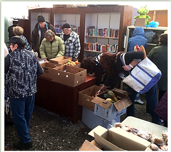
Bookcases with Lisa Libraries books at the Reservoir Food Pantry in Boiceville, NY.

We plan to continue this initiative, donating books to food banks across the country, partnering with organizations working to feed hungry families.