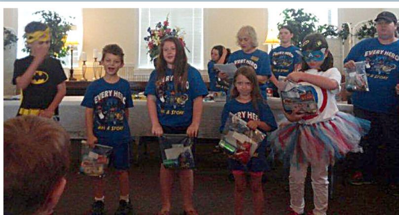
Winners of the Woodville Public Library's summer reading program contest with their prizes, which included books from The Lisa Libraries.