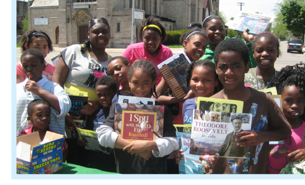
Sistahs Reachin' Out, Detroit, Michigan

440 books were donated to this organization that works with children in the foster care system, as well as those living with relatives or non-relative caregivers, many of whom are elderly.